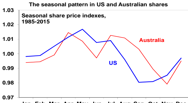
Jan Feb Mar Apr May Jun Jul Aug Sep Oct Nov Dec

But let's first take a look at seasonal patterns. It's well known that the best time for shares is from November to May and that the worst time is from May to November. This can be seen in the next chart, which shows the seasonal pattern in share markets since 1985 (after removing the underlying rising trend).